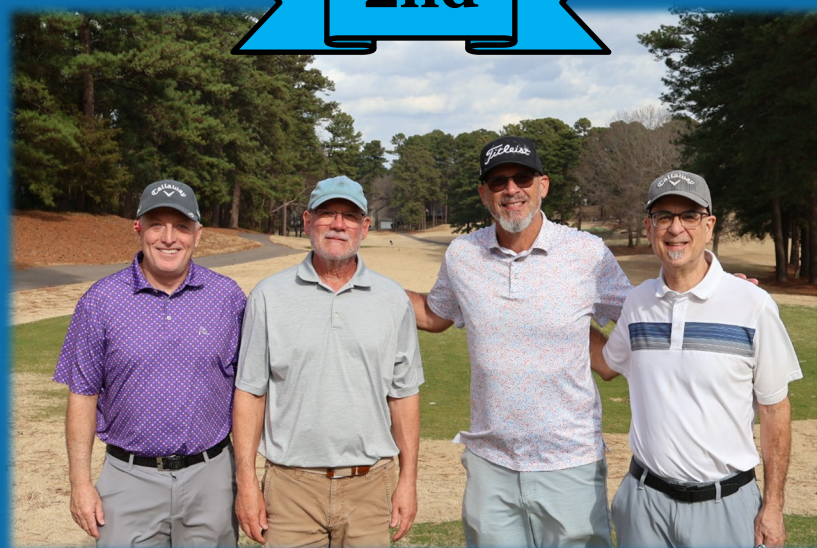
Lagrasta+ Ashby+ Woods+ Steadman