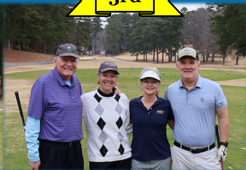
Short+ Short + Wing + Wing