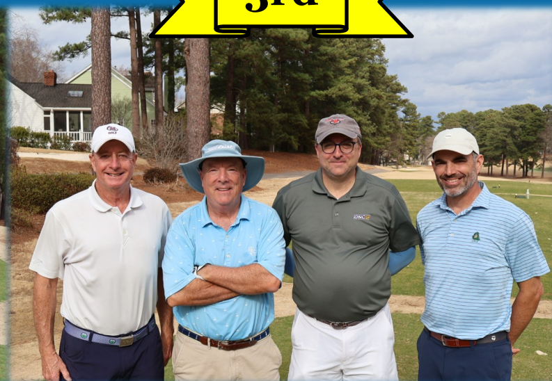
Barton + Herring + Gearing + Monaco