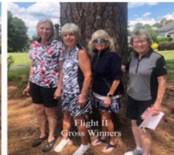
Flight II Gross Winners