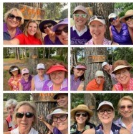
Happy Wildflowers at Kay's Corner

REMINDER: We are on a 4 hour & 15 minute golf round. "Ready Golf" means all golfers should go to their balls as soon as safely possible and get ready to play their shots. While waiting to hit, players should survey their shot, select their club and stand at their ball ready to go when it is their turn.