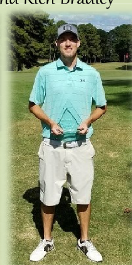
T. Manyatis Club Championship