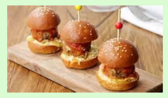
$10 Entry Fee

Don't miss out on our most unique Thirsty Thursday yet! We will be pairing different types of wine with the tastiest sliders.